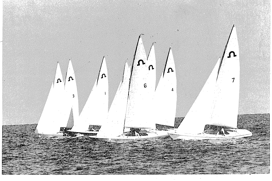
SOLINGS hit the starting line for first race of the Adams Cup series for the women's national championship. Rochester (N.Y.) Yacht Club hosted the regatta.