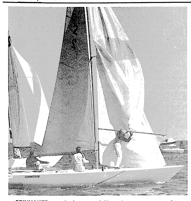
SPINNAKER snarls hampered New Jersey area crew's efforts in the first race of the Adams Cup. Their Soling was aptly named Commotion.