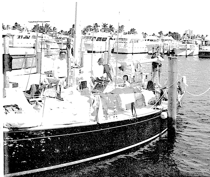
FIREFLY drying out in Ft. Lauderdale on way to 2nd in Division in 1971 SORC. Shumway/Odenbach/Goldstein Syndicate.