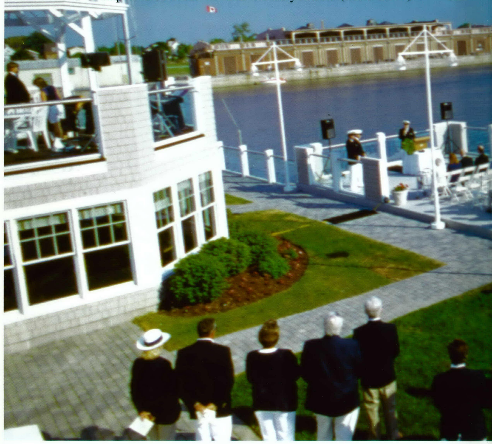
1999 Memorial Day Morning Colors' Service.

Chapter Three. On To The Century Mark: (1954-1977) 58