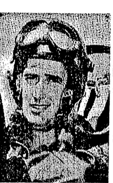
TED WILLIAMS to rejoin Red Sox

The Sox have been playing championship ball ever since it was announced earlier this month that Williams would be released by Aug. 1. It could be that that news was the vitamin pill that stimulated the Red Sox into a real pennant push.