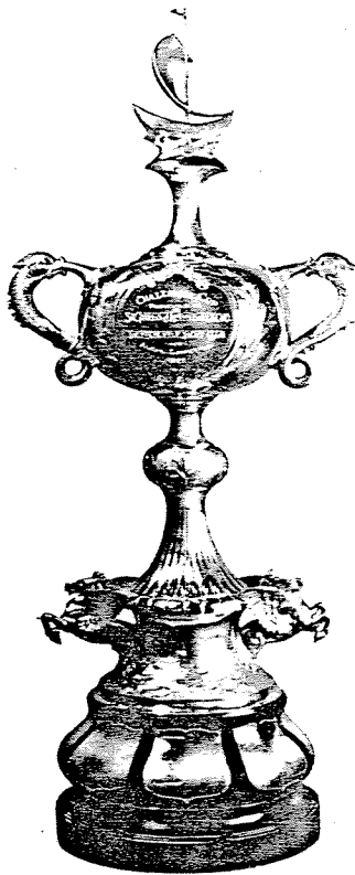
THE LIPTON TROPHY